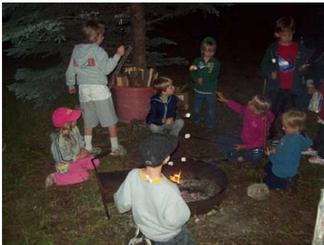
Roasting marshmallows at our campfire!