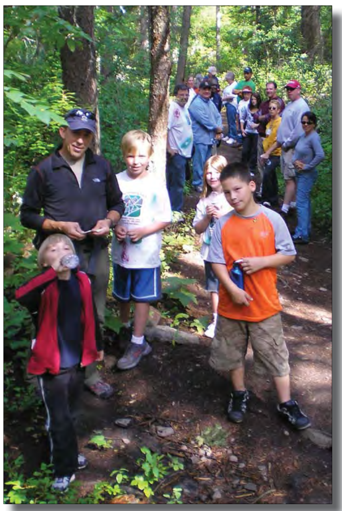
Participants of the 2009 RMHBDA Family Camp.

treated to perfect weather for all outdoor activities. The rains only came while we slept! This year's camp was a perfect blend of activities and family time. If you didn't hike, you could be in the bean-bag tourney; if you were a teen, the Knights Crossing kept your interest. Our family enjoyed the fire side s'mores, the astronomy lessons of today and of the past, sharing a cabin with other families, and settling the controversy of bean-bag Family Champion. Thank you to the families that came to share and reconnect. You are why we come to camp!