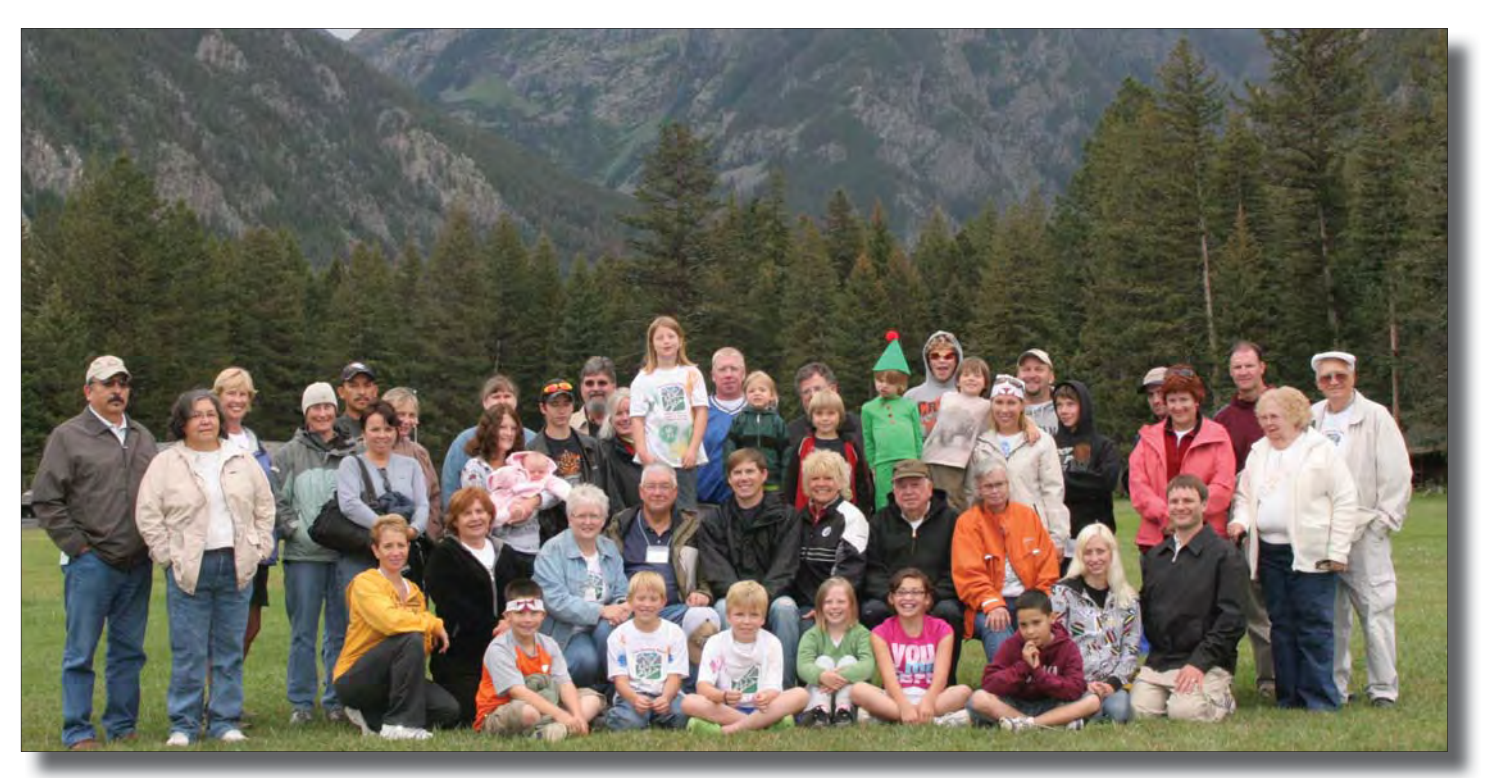
Participants of the 2009 RMHBDA Family Camp.